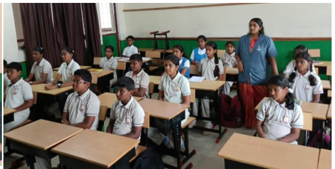
JNR- Oru Nimida Pechu