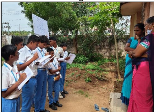
Amethi Nagar Anganvadi

On 4 th December, our Interact club members surveyed the condition and requirements of local Anganwadi schools in Amethi Nagar and Kamatchi Nagar. Our Interactors are planning to enhance & support them on a later date.