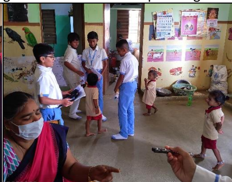
Interactors surveying the Anganvadi