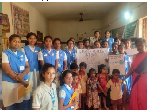
Kamatchi Nagar Anganvadi