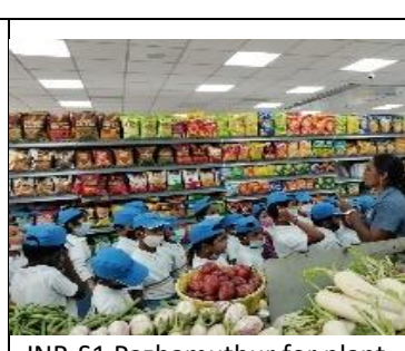
JNR-S1 Pazhamuthur for plant food and animal food