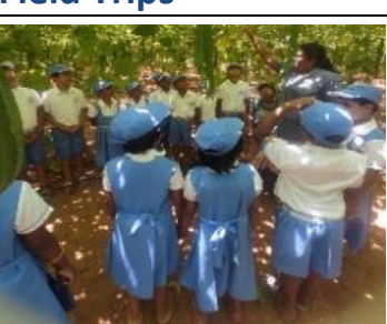
JNR-S2- Type of plants-visit to a farm